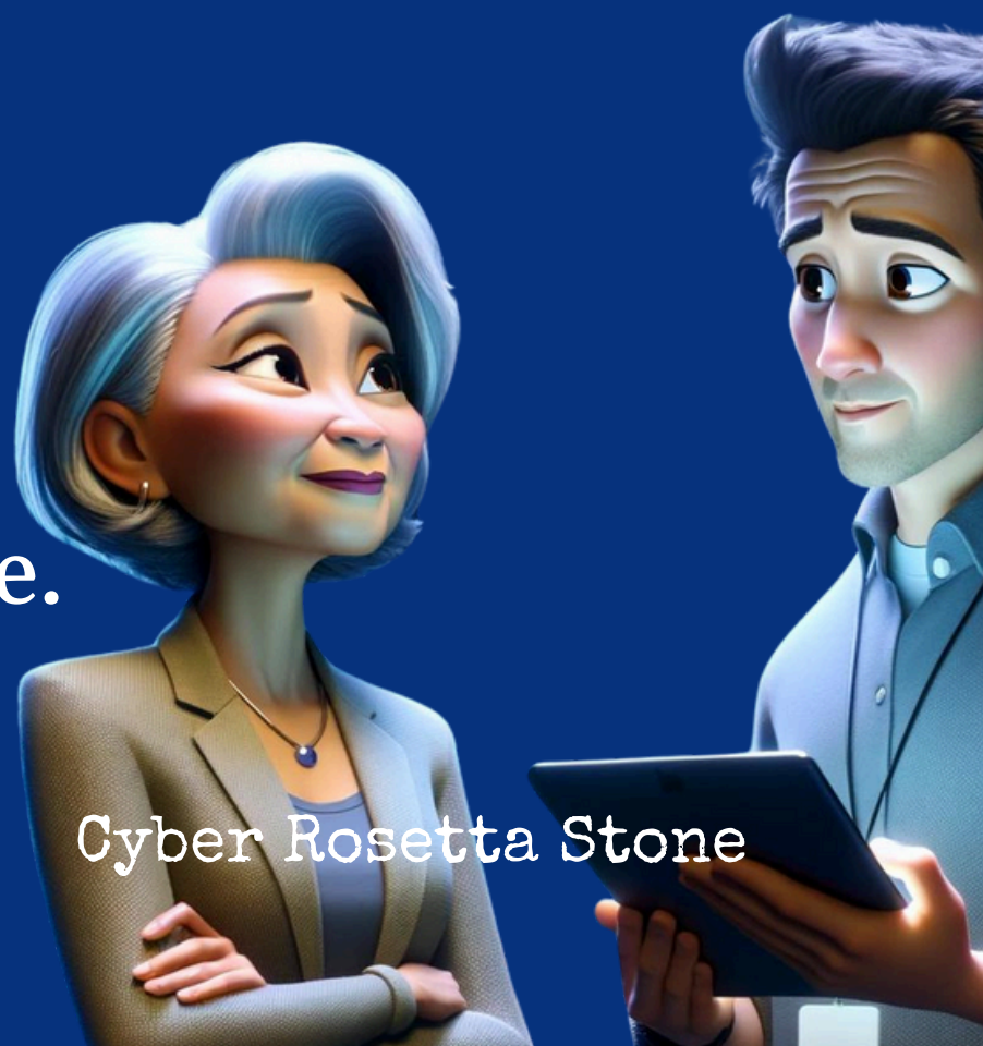
Cyber Rosetta Stone

...and buy your Risk Manager a coffee, they'll be happy to get you onside.